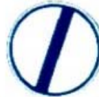
END OF RESTRICTED ZONE (b)