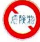
ROAD CLOSED FOR VEHICLES CARRYING EXPLOSIVES