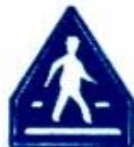
CROSS WALK (a)