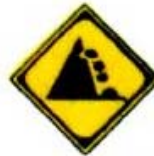
POSSIBLE FALLING STONES