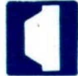
PULL OVER AREA