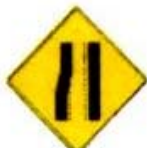
NUMBER OF LANES REDUCED