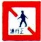
ROAD CLOSED FOR PEDESTRIANS