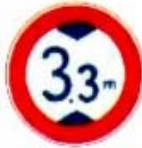
HEIGHT LIMIT (3.3 METERS)