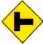
SIDE ROAD AHEAD