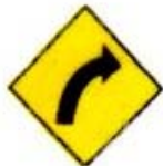
SHARP RIGHT CURVE