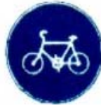
EXCLUSIVE ROAD FOR BICYCLISTS