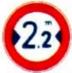
MAXIMUM WIDTH (2.2 METERS)