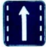
DIRECTION DESIGNATED LANE