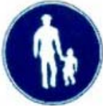
EXCLUSIVE ROAD FOR PEDESTRIANS