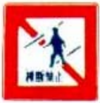
NO PEDESTRIAN CROSSING