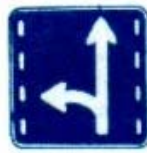
DIRECTION DESIGNATED LANE