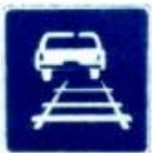
MAY DRIVE ON TRAM WAY