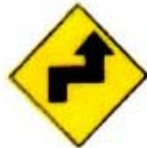
RIGHT TURN FOLLOWED BY LEFT TURN