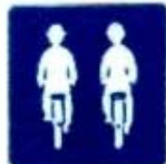
DOUBLE FILE BICYCLE RIDING ALLOWED