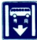
BUS EXCLUSIVE LANE