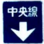
DESIGNATED CENTER LANE