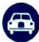
MOTOR VEHICLES ONLY