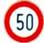
MAXIMUM SPEED LIMIT (50 KPH OR 37 MPH)