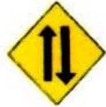
TWO WAY TRAFFIC