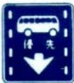
BUS PRIORITY LANE