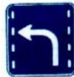
DIRECTION DESIGNATED LANE