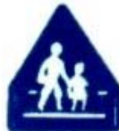
CROSS WALK (b)