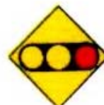
TRAFFIC SIGNAL AHEAD