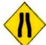
WIDTH OF ROAD REDUCED