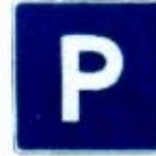
PARKING AREA OR MAY PARK