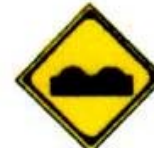
BUMPY ROAD AHEAD