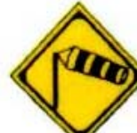
CAUTION, SIDE WIND