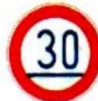
MINIMUM SPEED LIMIT (30 KPH OR 19 MPH)