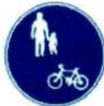
EXCLUSIVE ROAD FOR BICYCLISTS AND PEDESTRIANS