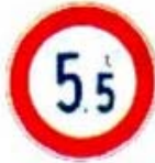
WEIGHT LIMIT (5.5 TONS)